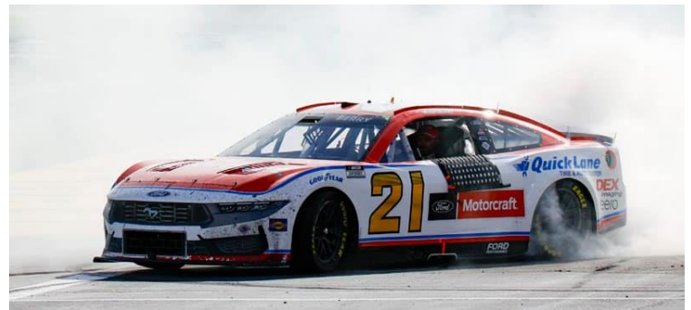
NASCAR Ford Mustang driver, Josh Berry, picked up his first career Cup win 3/16 at the Pennzoil 400 in Las Vegas. It was Ford's first win of 2025.