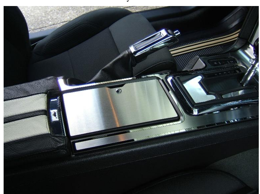
The final piece added was the ACC cup holder cover to match the Stainless-Steel look of the other two parts.

I next went back to CJ Pony Parts and ordered the third part of this ACC stainless steel package, their Center Console Cup Holder Cover Brushed Stainless Steel 2010-2014, Item Number 271022. This was the cover that was intended as a part of this set, so now everything matched. When it arrived, I carefully pried off my old billet cover by inserting small screwdrivers between this cover and my original plastic cup holder cover after first lining the edges of my plastic cup holder cover with masking tape so that it would not be scratched. Fortunately my older billet cover popped off easily as it was not two-sided taped very well. I then installed my new ACC version, and it looked extremely good. I should have added that part years ago! Now the job was completely finished after five or six hours of effort. All three areas of the new ACC stainless steel trim looked great and matched the other stainless trim elsewhere in my interior.