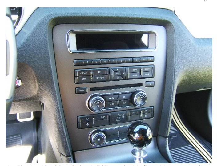
Radio bezel with minimal billet trim before the conversion.

For my latest interior modifications from ACC I went on the CJ Pony Parts site and ordered Item Number 271021, Radio Bezel Trim Plate Stainless-Steel Brushed And Polished Without Navigation 2010-2014, as well as their Item Number 271065. Center Console Trim Plate Brushed Stainless-Steel With Polished Trim Automatic 2010-2014. The first plate sits against the radio cover and the other is placed on the shifter console. For those Mustangs with manual transmissions, ACC also makes Number 271066, Center Console Trim Plate Brushed Stainless-Steel With Polished Trim Manual 2010-2014,