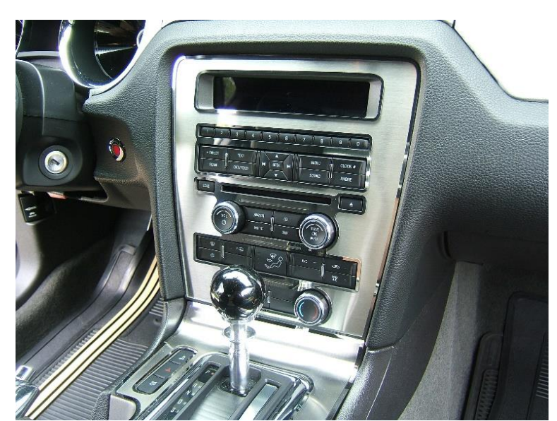
The installed stainless steel radio bezel was a major upgrade to my Mustang's interior.