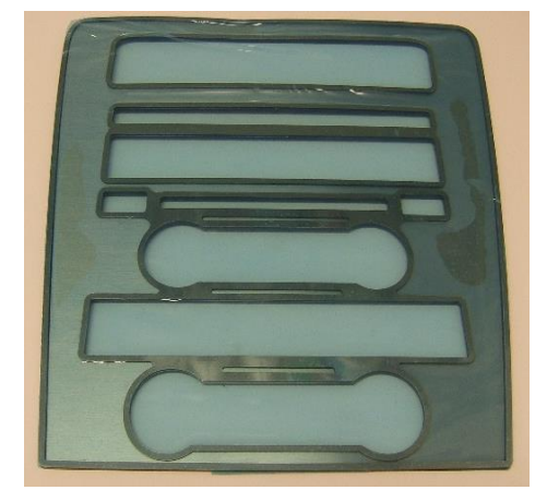
Stainless radio bezel with protective blue plastic covering.

they belong on the first attempt. You will only try at get one placing each part. Once they make contact and start to stick, there is no getting them off again.